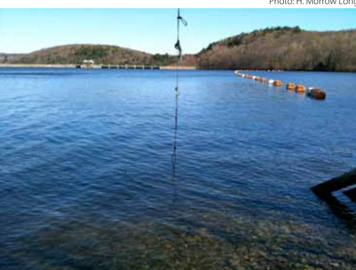
Lake Lillinonah is a fishing destination in Connecticut that is protected thanks to provisions of the Clean Water Act allowing public input into decisions about discharge permits.

Over the course of the next seven years, the Conservancy transferred the land to the California State Department of Fish and Game and the Monterey Peninsula Park District to begin the transition of the ranch into parkland. Today, the northern half of the former ranch comprises the new Palo Corona Regional Park, open to the public for hiking; the southern half of the parcel was added to the adjacent Joshua Creek Ecological Preserve.<sup>26</sup> The "gateway to Big Sur," the land now provides a safe home for coastal trout and the red-legged frog and tiger salamander in its perennial creeks, which are now likely to remain protected from runoff pollution for years to come.<sup>27</sup>