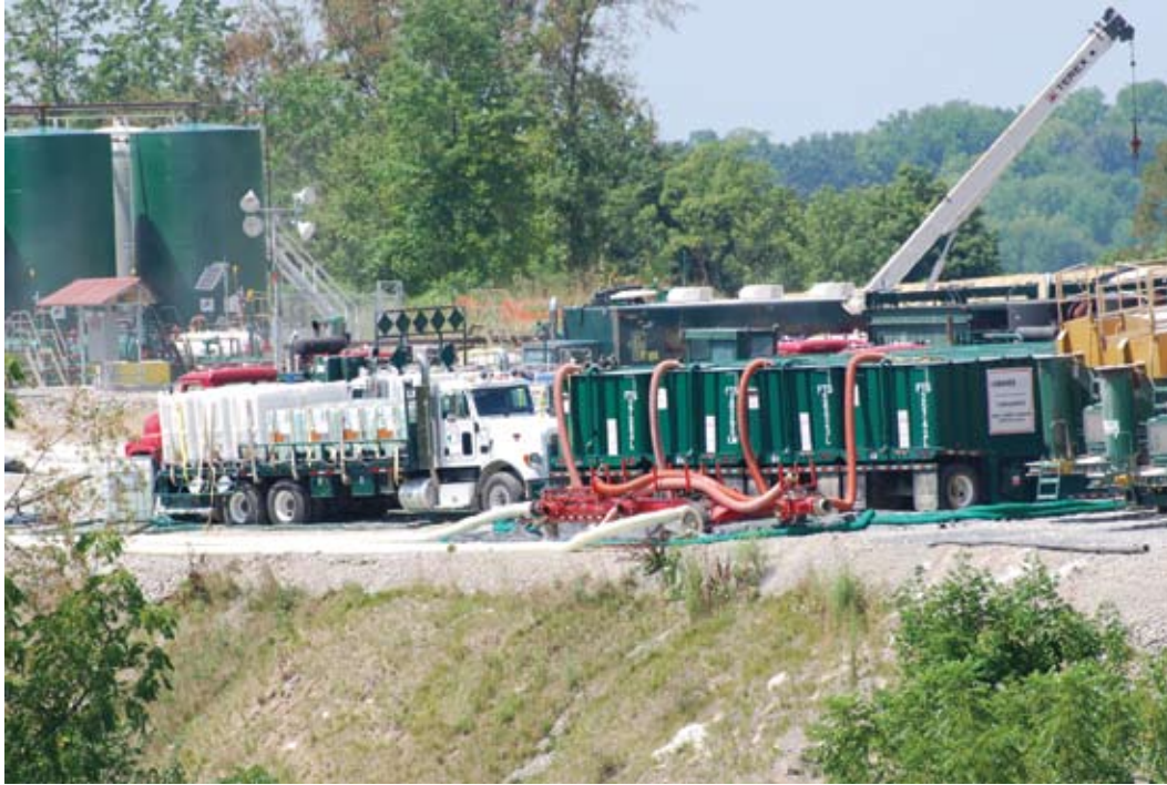
Fracking requires millions of gallons of water and large quantities of sand and chemicals, all of which must be transported to well sites, inflicting damage on local roads. Above, a well site in Washington County, Pa.

each fracking well requires approximately 400 truck trips for the transport of water and up to 25 rail cars' worth of sand. 86 The process of delivering water to a single fracking