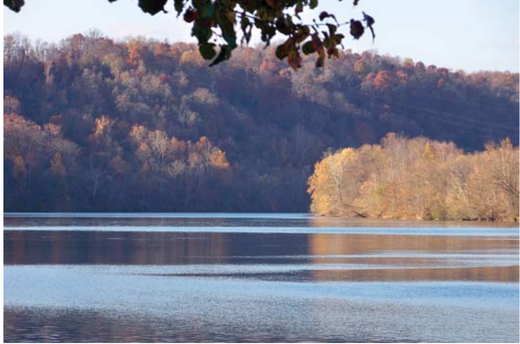
The Monongahela River, shown here at Rices Landing, Pa., has been affected by discharges of fracking wastewater and by water withdrawals for fracking. A 2011 Army Corps of Engineers report concluded that “the quantity of water withdrawn from streams [in the Monongahela watershed] is largely unregulated and is beginning to show negative consequences.”

Spills, blowouts and other accidents related to fracking have caused numerous fish kills in Pennsylvania. In 2009, a pipe containing freshwater and flowback water ruptured in Washington County, Pennsylvania, triggering a fish kill in a tributary of Brush Run, which is part of a high-quality watershed. 60 That same year, in the same county, another pipe rupture at a well drilled in a public park killed fish and other aquatic life along a three-quarter-mile length of a local stream. 61