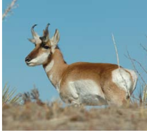
Pronghorn antelope are among the species that have been affected by intense natural gas development in Wyoming.

lution reduction targets designed to restore the bay to health. 69 Based on an estimate of the cost per pound of nitrogen reductions from a recent analysis of potential nutrient trading options in the Chesapeake Bay watershed, 70 the cost of reducing nitrogen pollution elsewhere to compensate for the increase from natural gas development would run to approximately $1.5 million to $4 million per year.