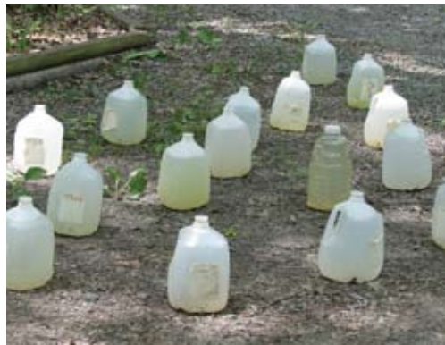
Residents of Dimock, Pennsylvania, are among those who have reported drinking water contamination in the wake of nearby fracking activity. Here, discolored water from local wells illustrates the change in water quality following fracking.

A great deal of public attention has been focused on the immediate impacts of fracking on the environment, public health and communities. Images of flaming water from faucets, stories of sickened families, and incidents of blowouts, spills and other mishaps have dramatically illustrated the threats posed by fracking.