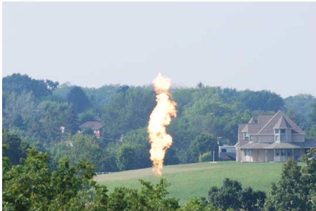
In parts of the country, fracking takes place in close proximity to homes, schools and hospitals, creating the potential for conflict. A Texas study has found that some homes near fracking well sites have lost value. Above, a natural gas flare near homes in Hickory, Pa.

While estimates of the costs of plugging and remediation of fracked wells vary, those costs almost always exceed a state's bonding requirements. Pennsylvania's recently revised bonding requirements, for example, require drillers to post maximum bonds of only $4,000 per well for wells less than 6,000 feet in depth and $10,000 per well for wells deeper than 6,000 feet, creating the potential for the public to be saddled with tens or hundreds of thousands of dollars in liability for plugging and reclamation of abandoned wells whose owners have gone bankrupt or walked away from their responsibilities. 105 The experience of previous resource extraction booms and busts suggests that the full bill for cleaning up orphaned wells may not come due for decades.