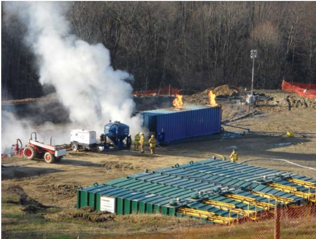
Volunteer firefighters respond to a fire in a wastewater pit at an Atlas Energy Resources well site in Washington County, Pa., in March 2010. Fracking places increased demands on emergency responders, creating new dangers that require additional training, and increasing demands for response to traffic accidents involving heavy trucks.

“A 2011 study of a Marcellus Shale well by researchers with the University of Pittsburgh estimated the cost of site reclamation (including reclamation of retention ponds and repairs to public roads) at $500,000 to $800,000 per well site.”