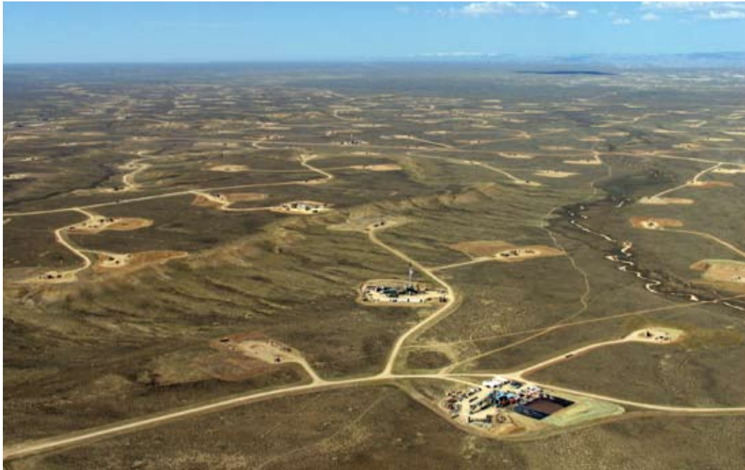
Oil and gas development fragments valuable natural habitat. Above, the Jonah gas field in Wyoming.

Other natural features affected by fracking—including groundwater, rivers and streams, and agricultural land—provide similar natural services. The value of all of those services—and the risk that an ecosystem’s ability to deliver them will be lost—must be considered when tallying the cost of fracking.