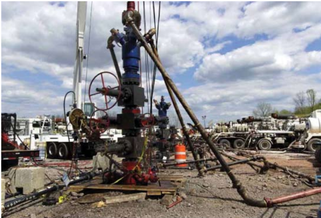
Equipment is put in place in preparation for hydraulic fracturing at a well site in Troy, Pa. In hydraulic fracturing, a combination of water, sand and chemicals is injected at high pressure to fracture oil or gas-bearing rock formations deep underground.

Once the necessary machinery and materials are assembled at the drilling site, drilling can begin. The well is drilled to the depth of the formation that is being targeted. In horizontally drilled wells, the well bore is turned roughly 90 degrees to extend along the length of the formation. Steel “casing” pipes are inserted to stabilize and contain the well, and the casing is cemented into place. A mix of water, sand and chemicals is then injected at high pressure—the pressure causes the rock formation to crack, with the sand propping open the gaps in the rock. Some of the injected water then flows back out of the well when the pressure is released (“flowback” water), followed by gas and water from the formation (“produced water”).