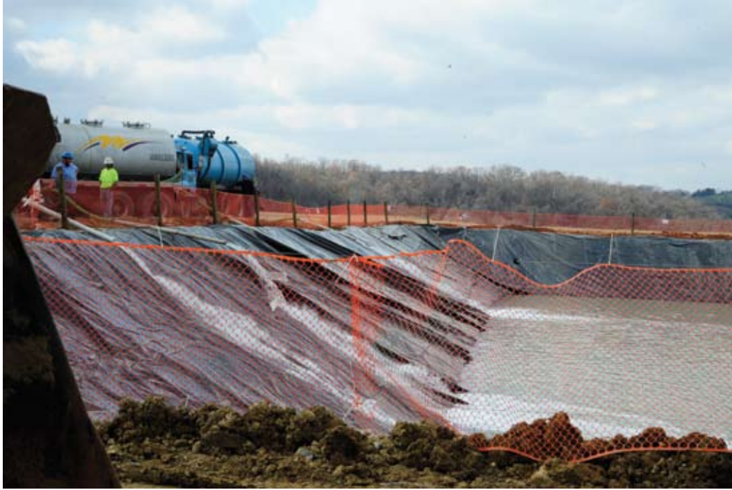
The disposal of fracking wastewater in open pits contributes to air pollution, while leakage from improperly lined pits has contaminated groundwater and surface water. Chemicals present in fracking wastewater have been linked to serious health problems, including cancer.

of the world's largest water filtration plants. New York has already had to take this step for one major source of drinking water, spending $3 billion to build a filtration plant for the part of the watershed east of the Hudson River. 27 The cost of doing the same for areas west of the Hudson, which sit atop the Marcellus Shale formation, was estimated in 2000 to be as much as $6 billion. 28