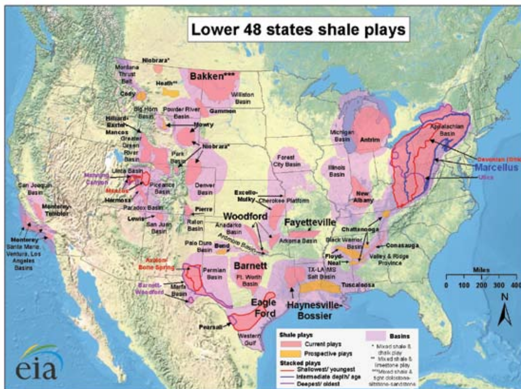
Figure 1. Shale Gas and Oil Plays 6

Updated: May 9, 2011