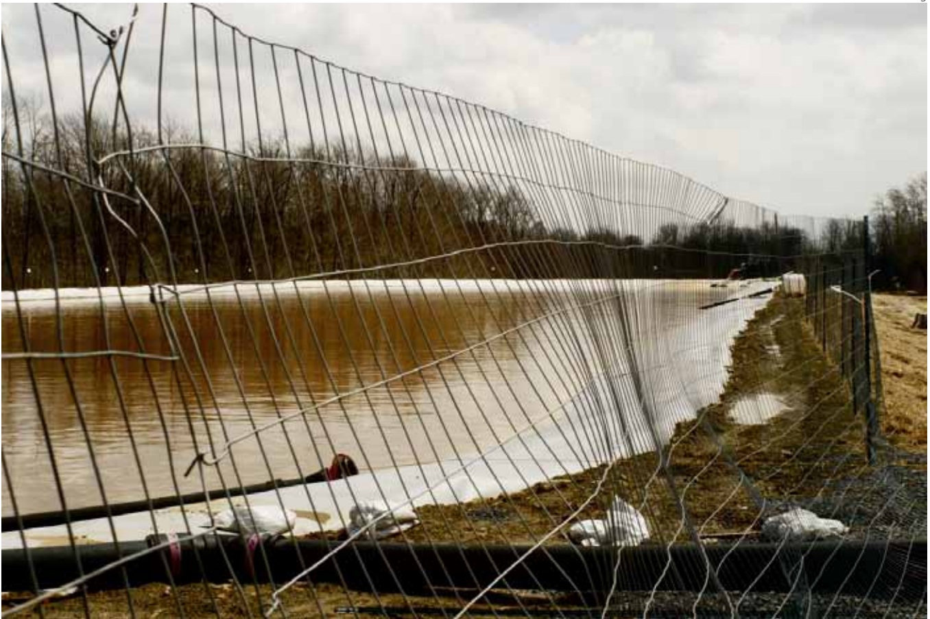
The storage and disposal of contaminated wastewater from fracking can lead to pollution of rivers, streams and groundwater. Pictured is a containment pond for wastewater at a Marcellus Shale natural gas drilling operation in Potter County, Pennsylvania.

depths commonly reached by fracking, despite documented instances in which fracking wells have cost $700,000 or more to plug. In addition, most states have “blanket bonding” options that further reduce the amount of financial assurance a driller must provide – in some cases to less than $100 per well.