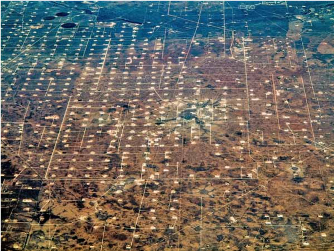
A grid of drilling sites and roads, similar to those used in fracking, lies across the landscape near Odessa, Texas.

In the years to come, fracking may affect a much bigger share of the landscape. According to a recent analysis by the Natural Resources Defense Council, 70 of the nation's largest oil and gas companies have leases to 141 million acres of land, bigger than the combined areas of California and Florida. 113 More-