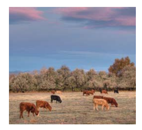
Fracking poses threats to farming, both directly through the potential loss of livestock due to exposure to toxic contaminants, and indirectly by increasing farmers' costs of doing business during the "boom" portion of the boom-bust cycle of development. Here, cows graze in Erie, Colorado, which has experienced fracking activity.

In arid western states, some farmers face higher costs for water as a result of competing demands from fracking. A 2012 auction of unallocated water conducted by the Northern Water Conservation District saw natural gas industry firms submit high bids, with the average price of water sold in the auction increasing from $22 per acrefoot in 2010 to $28 per acre-foot in the first