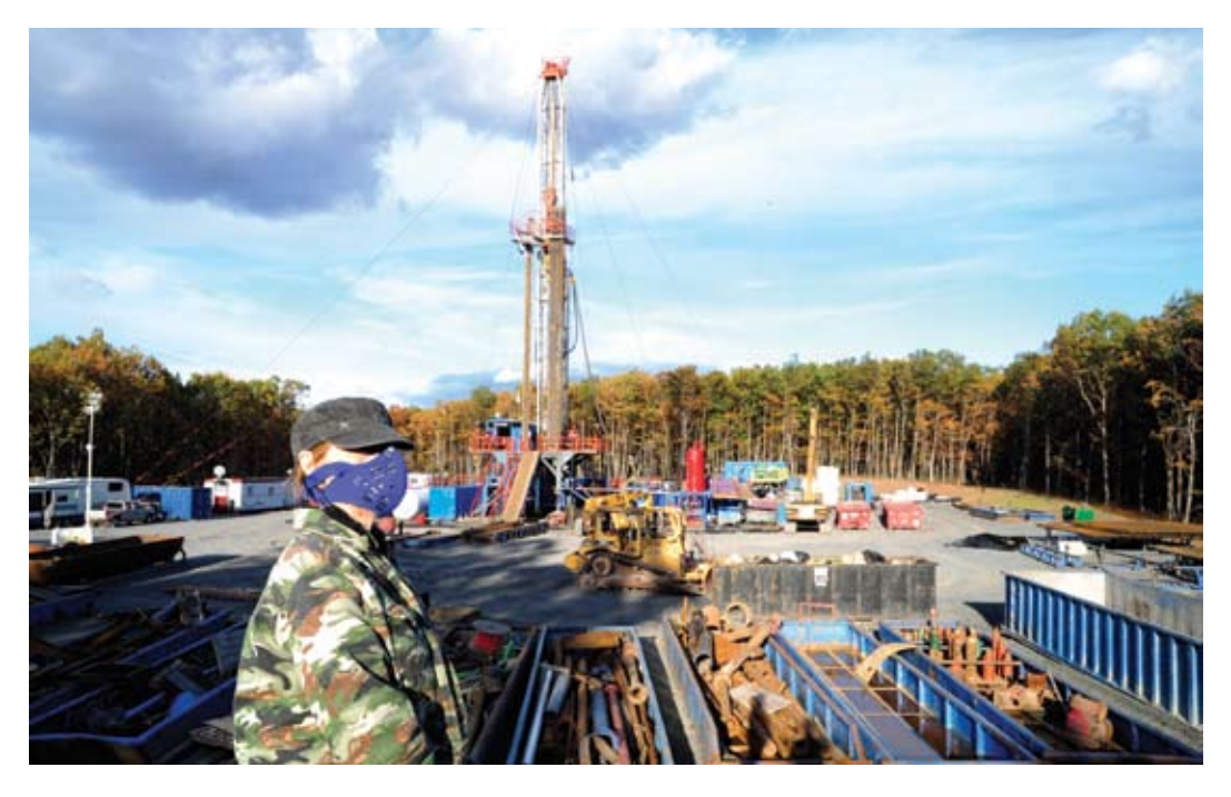
Fracking can be a dangerous business for workers. The National Institute for Occupational Safety and Health recently found dangerous levels of airborne silica at fracking sites in several states, while workers also risk injury from traffic accidents, falling objects, explosions and other hazards. Workers, their families and the public often bear much of the costs of workplace illness and injury.

tions during fracking. As silica is moved from trucks to the well site, silica dust can become airborne. Without adequate protection, workers who breathe in silica dust can develop an elevated risk of contracting silicosis, which causes swelling in the lungs, leading to the development of chronic