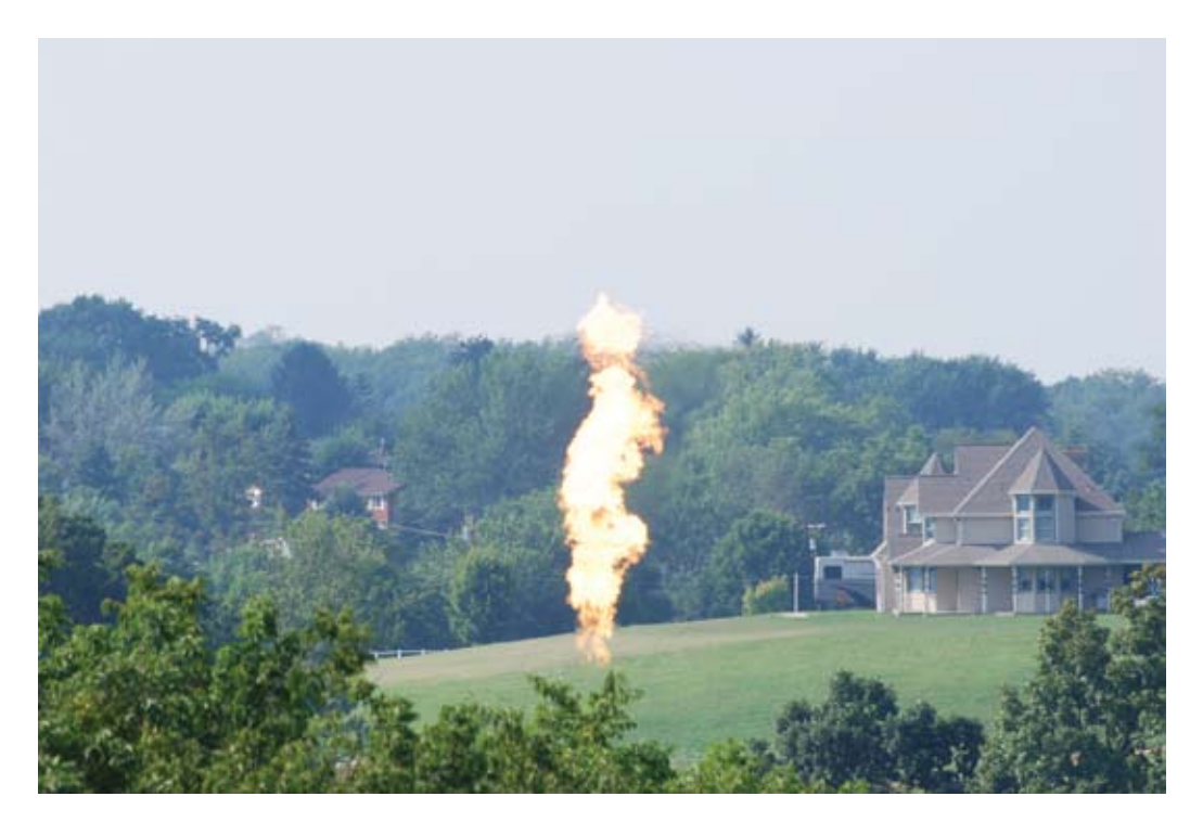
In parts of the country, fracking takes place in close proximity to homes, schools and hospitals, creating the potential for conflict. A Texas study has found that some homes near fracking well sites have lost value. Above, a natural gas flare near homes in Hickory, Pa.

While estimates of the costs of plugging and remediation of fracked wells vary, those costs almost always exceed a state's bonding requirements. Pennsylvania's recently revised bonding requirements, for example, require drillers to post maximum bonds of only $4,000 per well for wells less than 6,000 feet in depth and $10,000 per well for wells deeper than 6,000 feet, creating the potential for the public to be saddled with tens or hundreds of thousands of dollars in liability for plugging and reclamation of abandoned wells whose owners have gone bankrupt or walked away from their responsibilities.105 The experience of previous resource extraction booms and busts suggests that the full bill for cleaning up orphaned wells may not come due for decades.