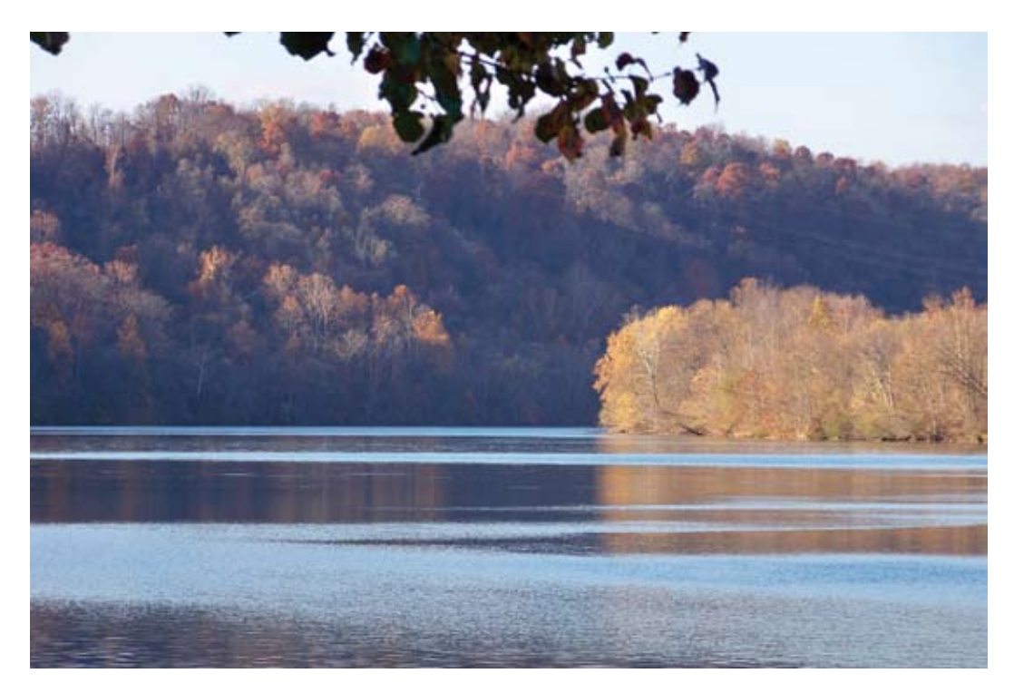
The Monongahela River, shown here at Rices Landing, Pa., has been affected by discharges of fracking wastewater and by water withdrawals for fracking. A 2011 Army Corps of Engineers report concluded that "the quantity of water withdrawn from streams [in the Monongahela watershed] is largely unregulated and is beginning to show negative consequences."

Spills, blowouts and other accidents related to fracking have caused numerous fish kills in Pennsylvania. In 2009, a pipe containing freshwater and flowback water ruptured in Washington County, Pennsylvania, triggering a fish kill in a tributary of Brush Run, which is part of a high-quality watershed.<sup>60</sup> That same year, in the same county, another pipe rupture at a well drilled in a public park killed fish and other aquatic life along a three-quarter-mile length of a local stream.<sup>61</sup>