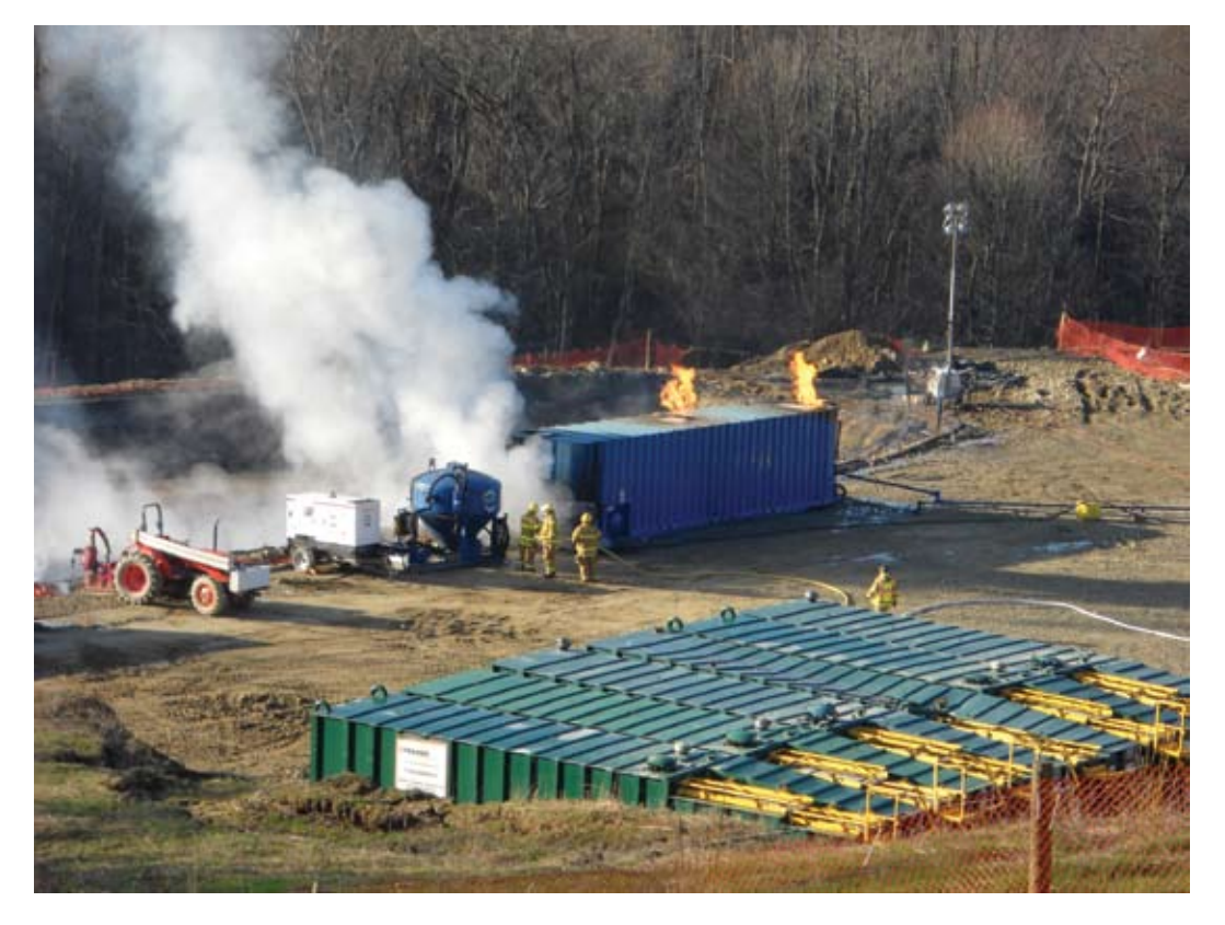
Volunteer firefighters respond to a fire in a wastewater pit at an Atlas Energy Resources well site in Washington County, Pa., in March 2010. Fracking places increased demands on emergency responders, creating new dangers that require additional training, and increasing demands for response to traffic accidents involving heavy trucks.

to costs is when a well plug fails, requiring attention years later. Chemical, mechanical or thermal stress can cause the cement to