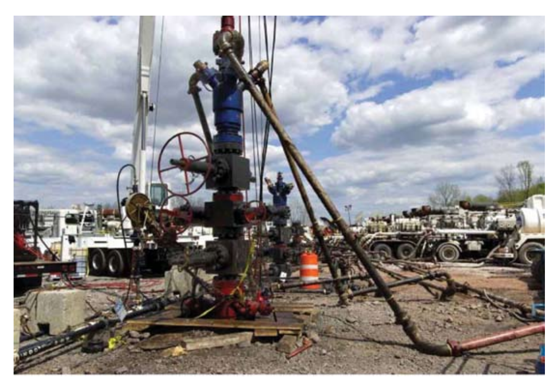
Equipment is put in place in preparation for hydraulic fracturing at a well site in Troy, Pa. In hydraulic fracturing, a combination of water, sand and chemicals is injected at high pressure to fracture oil or gas-bearing rock formations deep underground.

Once the necessary machinery and materials are assembled at the drilling site, drilling can begin. The well is drilled to the depth of the formation that is being targeted. In horizontally drilled wells, the well bore is turned roughly 90 degrees to extend along the length of the formation. Steel "casing" pipes are inserted to stabilize and contain the well, and the casing is cemented into place. A mix of water, sand and chemicals is then injected at high pressure—the pressure causes the rock formation to crack, with the sand propping open the gaps in the rock. Some of the injected water then flows back out of the well when the pressure is released ("flowback" water), followed by gas and water from the formation ("produced water").