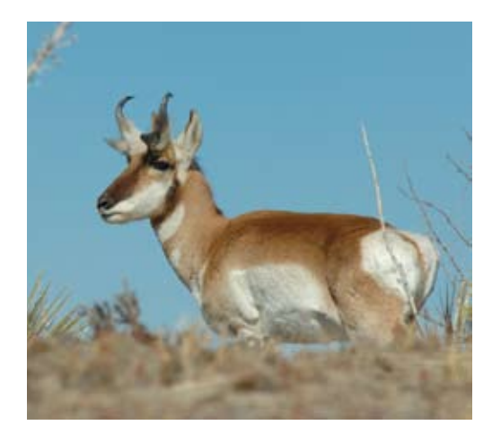
Pronghorn antelope are among the species that have been affected by intense natural gas development in Wyoming.

lution reduction targets designed to restore the bay to health.<sup>69</sup> Based on an estimate of the cost per pound of nitrogen reductions from a recent analysis of potential nutrient trading options in the Chesapeake Bay watershed,<sup>70</sup> the cost of reducing nitrogen pollution elsewhere to compensate for the increase from natural gas development would run to approximately $1.5 million to $4 million per year.