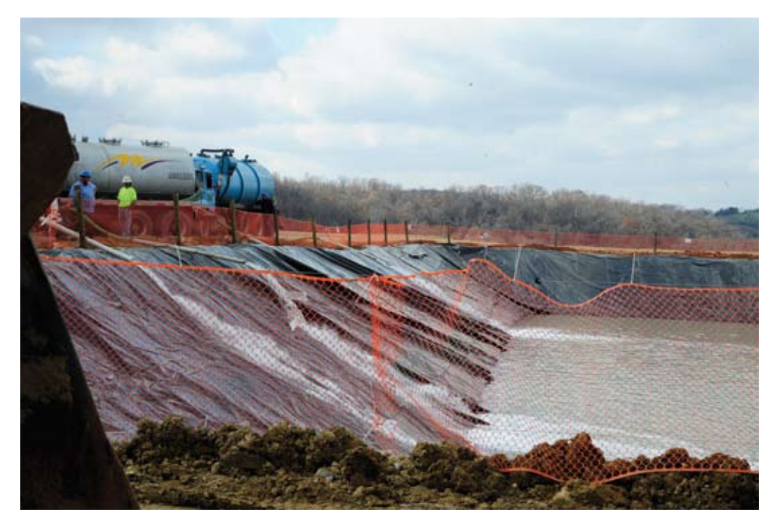
The disposal of fracking wastewater in open pits contributes to air pollution, while leakage from improperly lined pits has contaminated groundwater and surface water. Chemicals present in fracking wastewater have been linked to serious health problems, including cancer.

of the world's largest water filtration plants. New York has already had to take this step for one major source of drinking water, spending $3 billion to build a filtration plant for the part of the watershed east of the Hudson River.<sup>27</sup> The cost of doing the same for areas west of the Hudson, which sit atop the Marcellus Shale formation, was estimated in 2000 to be as much as $6 billion.<sup>28</sup>