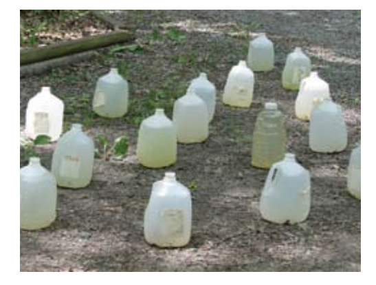
Residents of Dimock, Pennsylvania, are among those who have reported drinking water contamination in the wake of nearby fracking activity. Here, discolored water from local wells illustrates the change in water quality following fracking.

Less dramatic, but just as important, are the long-term implications of fracking—including the economic burdens imposed on individuals and communities. In this paper, we outline the many economic costs imposed by fracking and show that, absent greatly enhanced mechanisms of financial assurance, individuals, communities and states will be left to bear many of those costs.