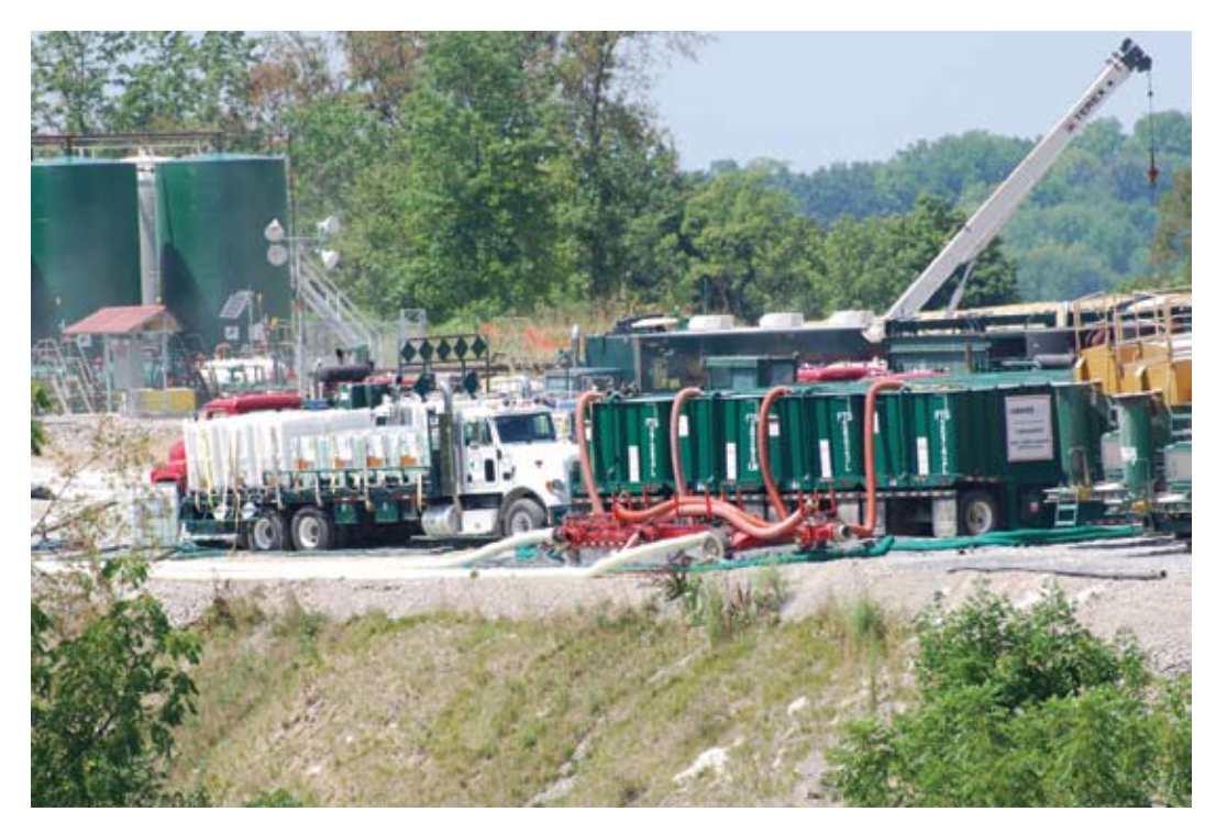
Fracking requires millions of gallons of water and large quantities of sand and chemicals, all of which must be transported to well sites, inflicting damage on local roads. Above, a well site in Washington County, Pa.

each fracking well requires approximately 400 truck trips for the transport of water and up to 25 rail cars' worth of sand.<sup>86</sup> The process of delivering water to a single frack-