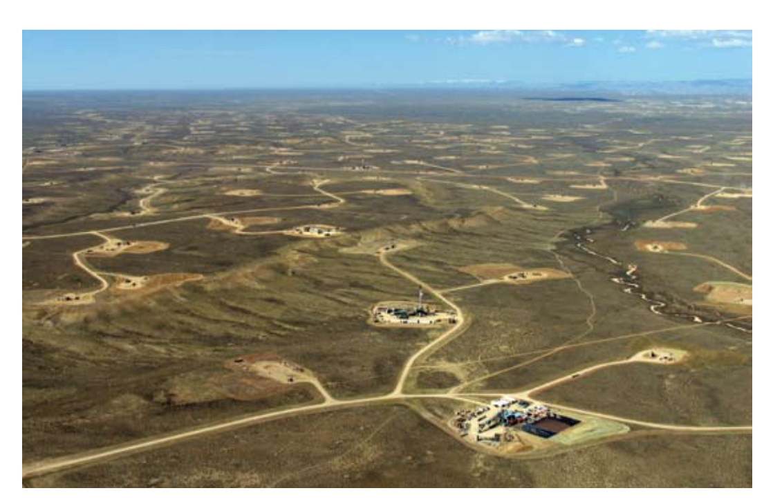
Oil and gas development fragments valuable natural habitat. Above, the Jonah gas field in Wyoming.

Other natural features affected by fracking—including groundwater, rivers and streams, and agricultural land—provide similar natural services. The value of all of those services—and the risk that an ecosystem's ability to deliver them will be lost—must be considered when tallying the cost of fracking.