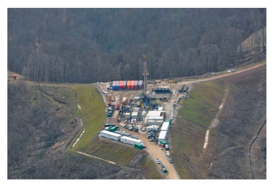
Fracking imposes a range of environmental, health and community impacts. Above, a fracking well site is built in a forested area of Wetzel County, W.Va.

draulic fracturing, to operate that well, and to deliver the gas or oil extracted from that well to market.