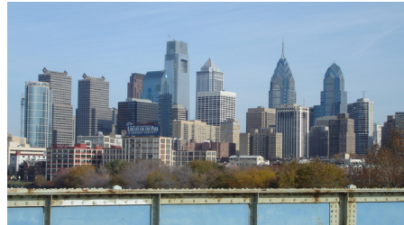
In 2014, Philadelphia committed to 20,000 solar roofs by 2025

The goal of the campaign is to have at least 20 cities embrace big solar targets by year-end 2017. We're working in commu-