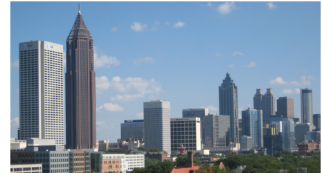
In 2015, Atlanta committed to putting solar on 28 city buildings.

nities from coast to coast toward this goal, everywhere from Maine to California.