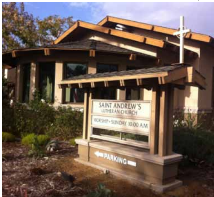
St. Andrew's Lutheran Church in Mar Vista installed its panels in October 2013.

Some unusual circumstances allowed St. Andrew's to buy its panels outright. Our Savior's Lutheran Church in downtown L.A. closed in 2003, and most of its parishioners moved to St. Andrew's. They brought with them all their old photos and baptismal records—and a substantial nest egg, more than enough to cover the cost of the panels.